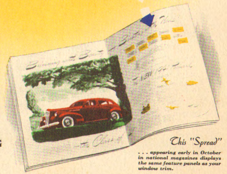
This "Spread" . . . appearing early in October in national magazines displays the same feature panels as your window trim.

Put it up the moment you have cars on display. Let your windows tell the news of the Class of '41!