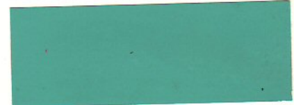
B TOURMALINE 55K32