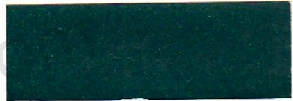
C EMERALD IRIDESCENT 55K33(GS)