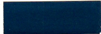
F SAPPHIRE IRIDESCENT 55K23