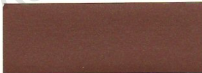
K TOPAZ IRIDESCENT 55K81