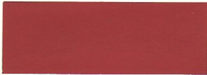
R SARDONYX 55K84