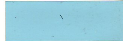
D ZIRCON 55K21