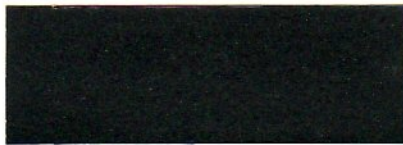
H GRAY PEARL IRIDESCENT 55K11