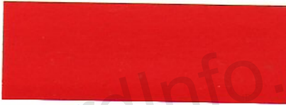
J FIRE OPAL 55K51