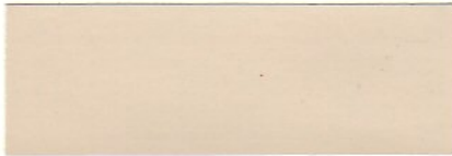
N AGATE 55K82