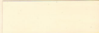
DUCO ★2403-H■ Dover White

M, MB (U), MC (U), MG (U), MJ (U), MK (U), ML (U), MN (U), MP (U), MR (U), MV (U), BM (L), CM (L), GM (L), JM (L), KM (L), NM (L), PM (L), VM (L), MAV (U), MES (U), MKN (U), MTV (U)