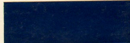
DUCO ★2404■ { Adriatic Blue Metallic