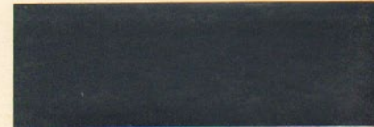
DUCO 2407-H { Maltese Gray Metallic

No DUCO Refinish match is available for Mojave Tan Metallic, Color Scheme R.