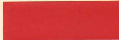
DUCO 2397-H Scottish Heather