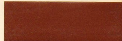
DUCO ★2396-H■ { Roman Copper "Metalli-Chrome"